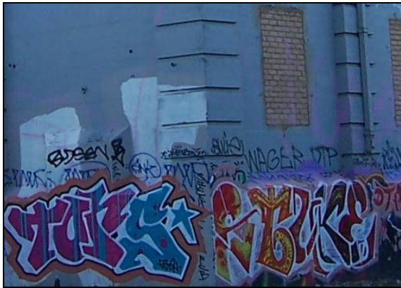
A Commuter's first view of Seaford