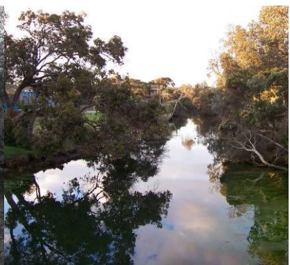
Kananook Creek 2025