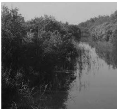
Kananook Creek 1933

Local planning and development MUST consider any detrimental impact it may have on the local environment and reduce damage to the ecology, flora and fauna.