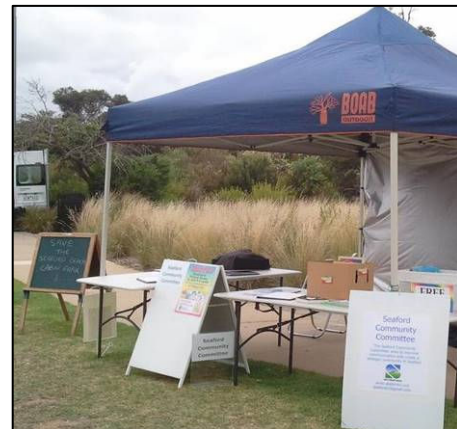
Setting up for Seaford Farmers' Market

It is expected that community representation of this nature will continue to provide direction for the Frankston City Council in the coming years just as it has in the past.