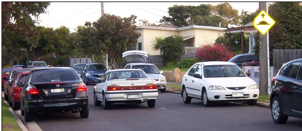
One-Way traffic in Mitchell Street – 4pm Wednesday 8 July 2015