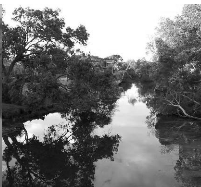
Kananook Creek 2008