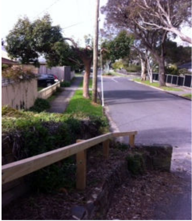
Coates Walk Hand Rail Our thanks to Frankston City Council for installing this welcome aid on a steep Creek descent.