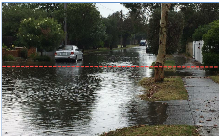
Johnstone Street Dec 2016 – the red line indicates the current SBO boundary and clearly shows the flooding now goes well beyond

Unless we have another Millennium Drought (1997 to 2009), we can expect significant flooding of the homes in the area when heavy rains occur. Recent flooding in Hobart is an extreme example of what happens when infrastructure fails to cope. Our current traffic congestion on the city freeways is another example of planning rushing ahead with development without consideration for infrastructure.